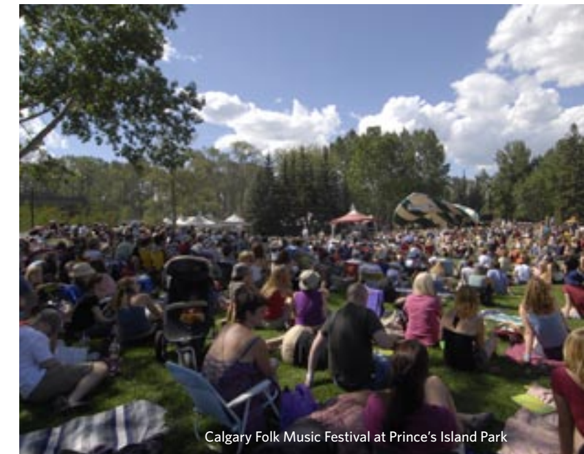
Calgary Folk Music Festival at Prince's Island Park

Images in these pages represent just a sampling of the many highlights from the 2006 / 2007 season. A whole book would be required to tell the story of all the activities going on in Calgary's bustling arts community, but we hope you'll enjoy this peek at some of the biggest milestones!