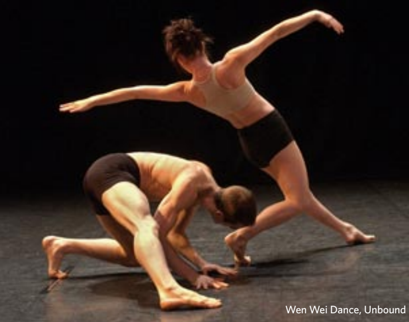
Wen Wei Dance, Unbound