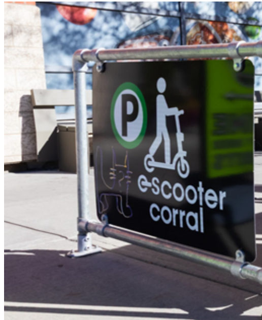
Figure 3: The artist will be required to place the e-Scooter logo on one panel design.